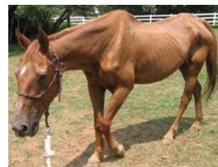
Sissy Boo Boo

Present in Honor of: (Name of recipient)